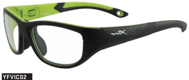
F: MATTE BLACK / LIME GREEN